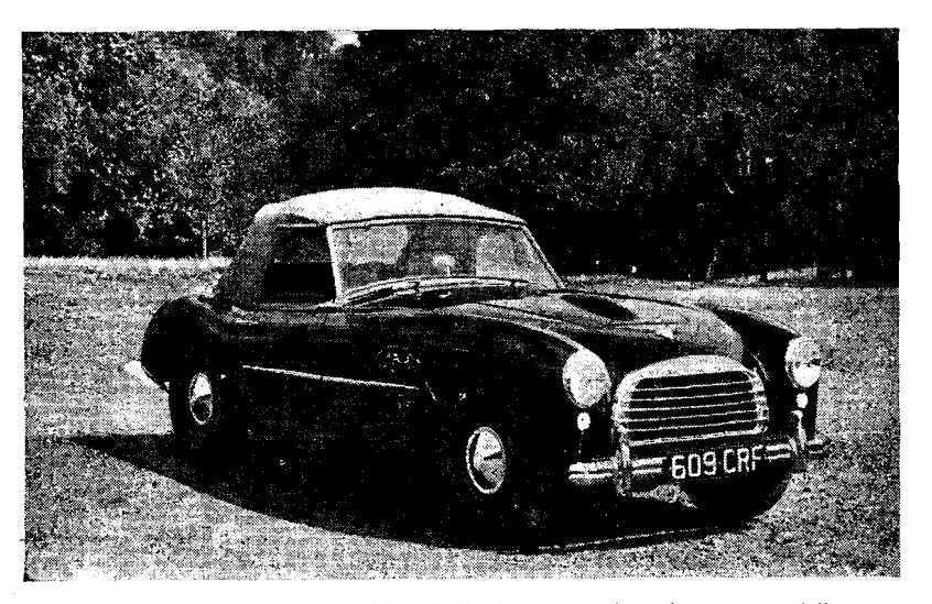
COMFORT AND PERFORMANCE of a high order have been successfully blended in the Doretti; among the well-designed equipment is a hood which is easy to raise single-handed and offers good weather protection.

Price of the Swallow Doretti is £777 (£1,101 17s. 6d. including purchase tax), and among the optional equipment available is the Laycock-de Normanville overdrive, wire-spoke wheels and special speed equipment for competition purposes.